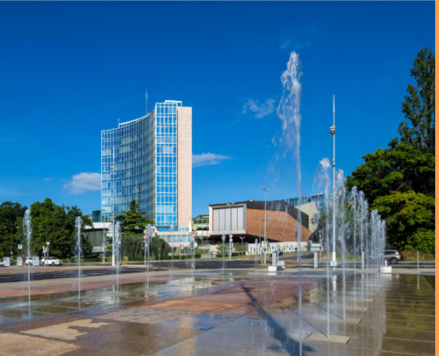
Headquarters building of the World Intellectual Property Organization (WIPO) in Geneva