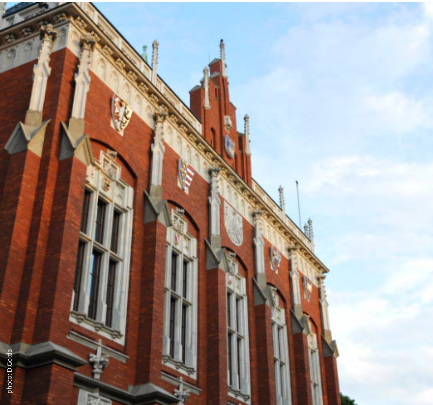
Main building of the Jagiellonian University in Kraków, built in 1873-1887