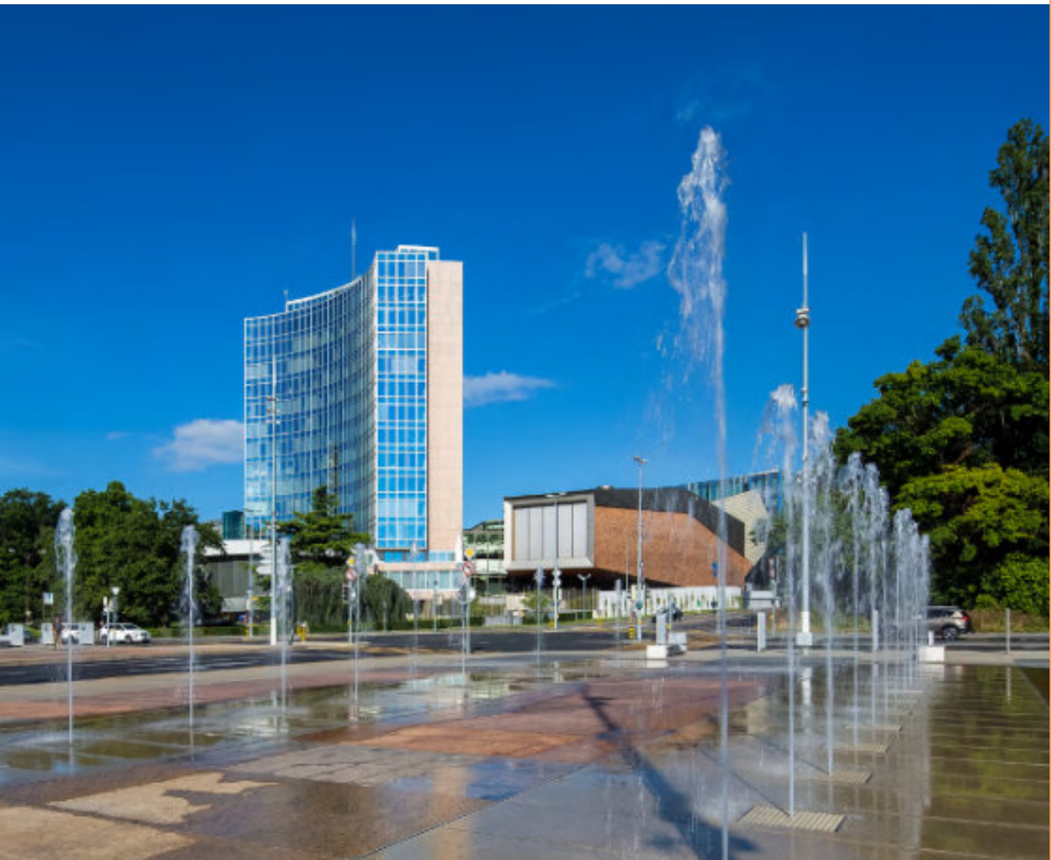
Headquarters building of the World Intellectual Property Organization (WIPO) in Geneva